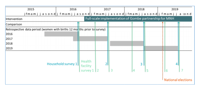
Figure 2 Study timeline. MNH, maternal and newborn health.

During the same period, we conducted seven facility and birth attendant surveys at six monthly intervals. Four surveys were done concurrently with the household surveys