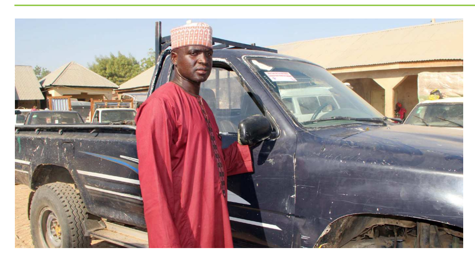
Photo left: ETS volunteer driver by his car, in Gombe State, Nigeria.