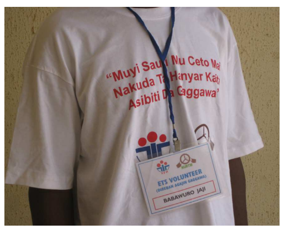
Photo right: ETS volunteer driver's T-shirt and badge, Gombe State, Nigeria.